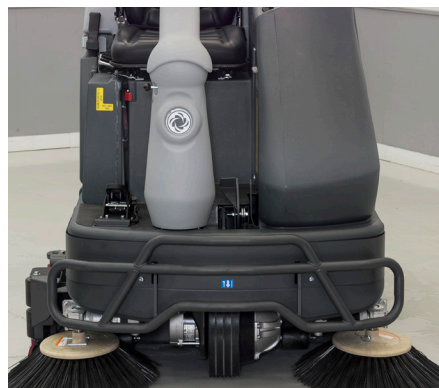
Dual side brooms (cylindrical models) deliver true edge cleaning

The exceptional Ecoflex system allows the operator to match the floor cleaning machine's performance to the soil on the floor and the required level of clean. When encountering more soiled areas of the floor, the operator can activate the "burst of power" button for extra cleaning performance, and as easily return to original settings for minimum usage of water, detergent and power. Green meets clean.