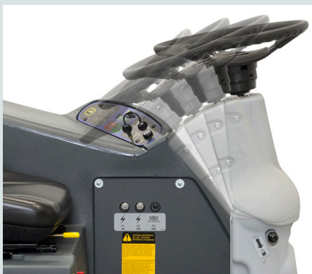
Tilt steering wheel for easy boarding, plus ergonomically designed operator compartment for safety and comfort