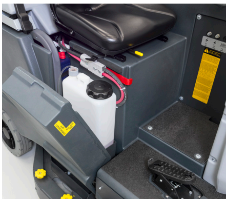
Ecoflex chemical kit (optional): easy accessible detergent cartridges