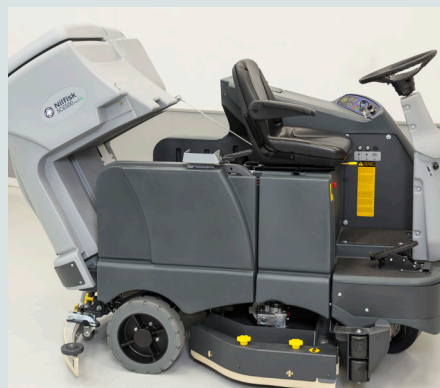
Tip-out and lift-off recovery tank